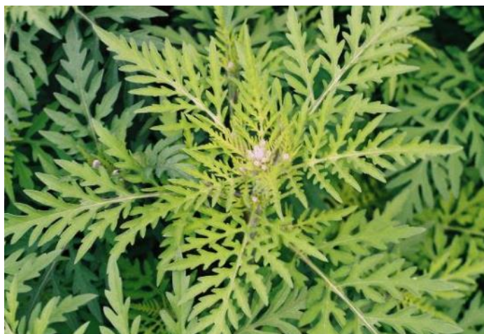
Typical leaves in young plant of common ragweed ( Ambrosia artemisiifolia L.)

Common ragweed ( A. artemisiifolia ) is also a bad agricultural weed that reduces yield in many crops and is difficult to control.