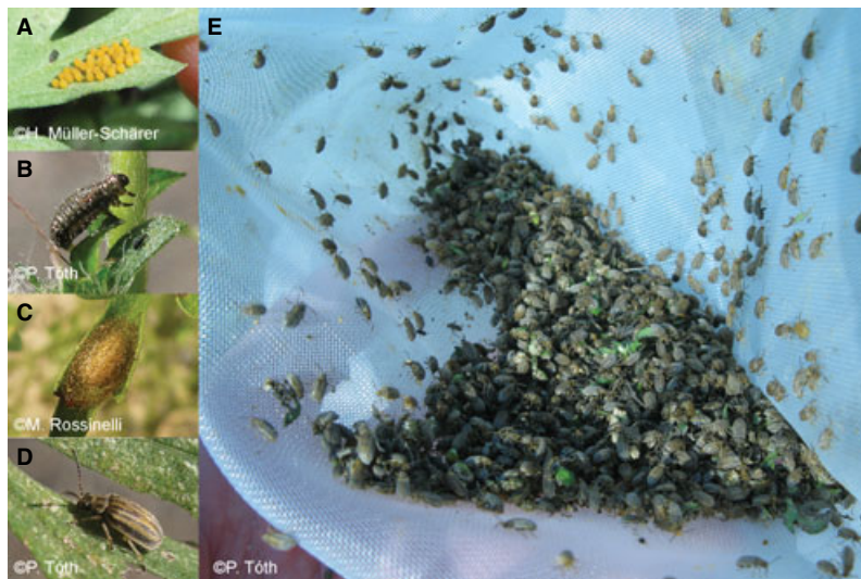
Fig. 3 Ophraella communa on Ambrosia artemisiifolia . Different developmental stages: A. Eggs; B. Larva; C. Pupa; D. Adult; and E. Thousands of O. communa in a sweeping net after 10 sweeps in a field full of A. artemisiifolia near Milano (Corbetta, 24 Sept. 2013). Adults and the three larval stages of the beetle all feed on the leaves. Based on extensive laboratory studies (Zhou et al. , 2010) and field observations (Chen et al. , 2013) on temperature dependent developmental time in China, we expect 3–4 beetle generations per year in the areas, where it is presently occurring in Europe.

Generally, the level of attack rapidly increased over time. In Switzerland, A. artemisiifolia plants with leaf beetles and leaf beetle feeding damage were first observed in mid-July 2013 in Balerna, canton Ticino. At that moment, plants were still in the vegetative or bolting phase. The damage consisted of perforated and desiccated, dead leaves (Fig. 1A). All developmental stages of the leaf beetle (Fig. 3A–D) were found to co-occur on single plants. Larvae were usually found on young leaves at the top of the plants, whereas eggs, pupae and adults were encountered throughout the plants. Incidence and level of attack strongly varied within and between sites. One month later in August, numbers of individuals per plant and incidence of attack had increased. More heavily attacked plants harboured mainly larval stages (Fig. 1B).