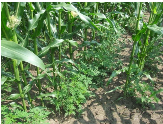
Ragweed as a weed in maize

The IRS regularly organises scientific conferences on all aspects of ragweed research. In 2011 the IRS has declared the first Saturday of the summer as the International Ragweed Day. Activities on and around this day are organised individually in many countries in order to raise public awareness about the plant, the problems it causes and potential measures to prevent further spread and reduce existing populations.