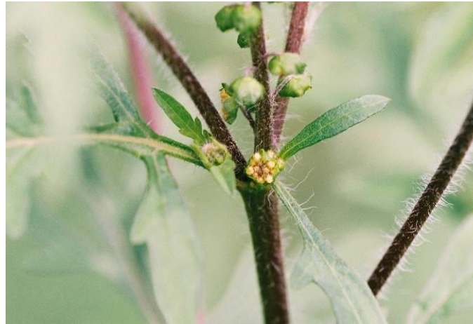
Male flower head

Research on methods to control ragweed: http://www.halt-ambrosia.de/