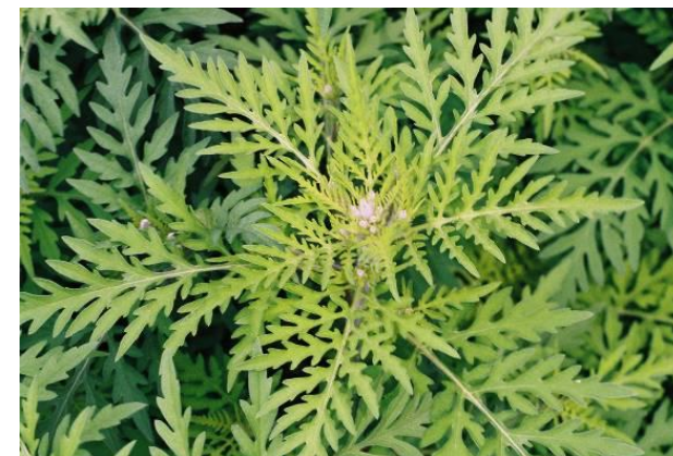
Typical leaves in young plant

Larger populations should be reported to the local authorities so that official control measures can be applied.