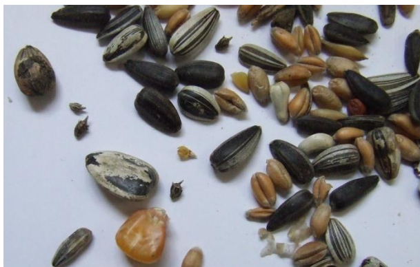
Ragweed seeds can be a contaminant of bird seed

Common ragweed ( A. artemisiifolia ) is also a bad agricultural weed that reduces yield in many crops and is difficult to control.